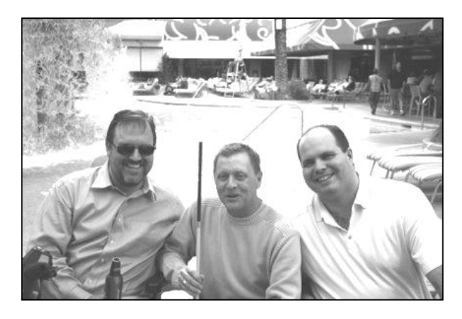
Illinois Vendors Enjoying Poolside Sun