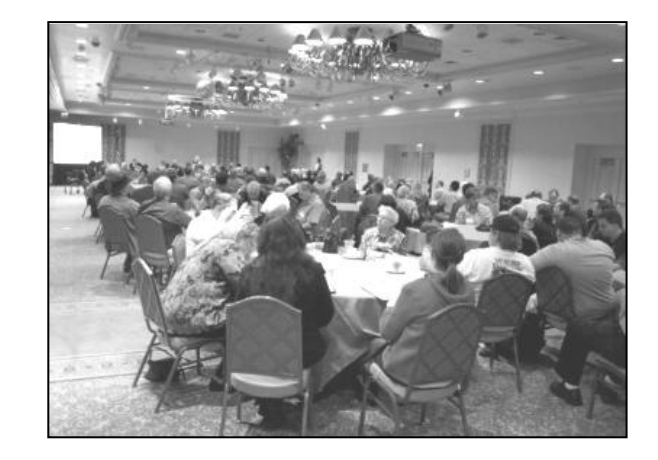
Attendees Listening Intently.